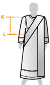
(K to L) Length.