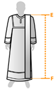
(E to F) Length