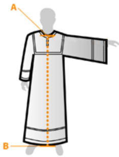
(A to B) Length from Neck to your ankle bone.